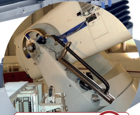
TKR series to avoid vibration