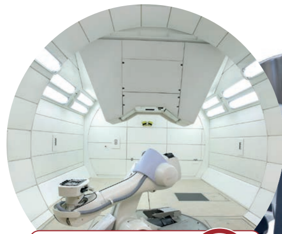
Nuclear medicine and radiotherapy