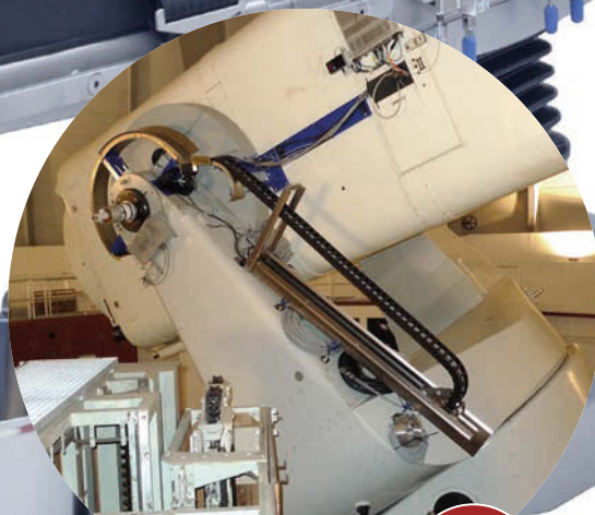
TKR series to avoid vibration