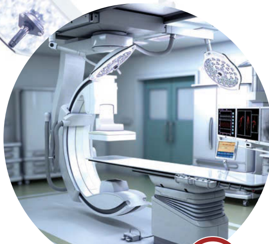
MRT, MEG, CT and x-ray