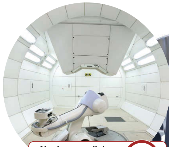
Nuclear medicine and Radiotherapy