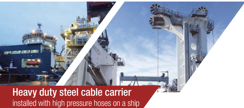
Heavy duty steel cable carrier installed with high pressure hoses on a ship