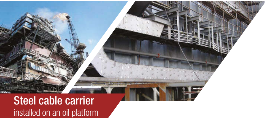
Steel cable carrier installed on an oil platform