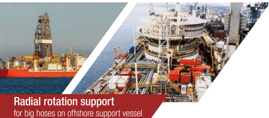
Radial rotation support for big hoses on offshore support vessel