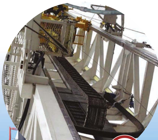
Land rig skidding