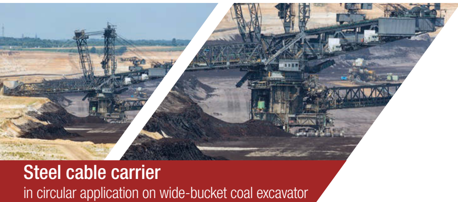
Steel cable carrier in circular application on wide-bucket coal excavator