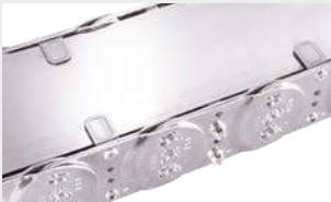
Steel band holder on the sidebands.

Steel band covers for the other types on request!