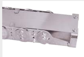
Fastening on the cable carrier connection with special end connector.